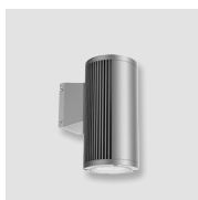
SIZE B D=155mm