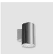
SIZE A D=100mm